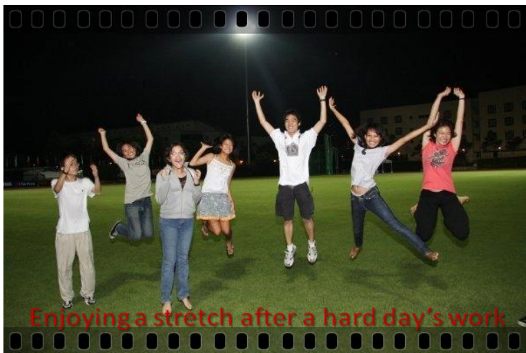
Enjoying a stretch after a hard day's work

By the time the first Asian Youth Games (AYG, 29 June -- 7 July 2009) ended on 7 July, its website ( http://www.ayg2009.sg ) had garnered 2.6 million hits.