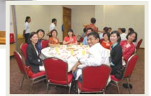
Deanery members and our Alumni catch up