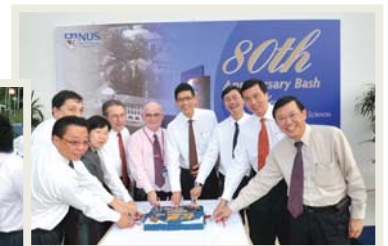
Cutting the celebratory cake