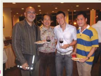
Enjoying the cocktails