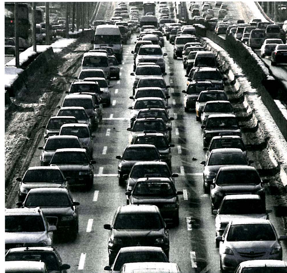
In January last year, monthly vehicle sales in China surpassed those of the US for the first time in history. China is now the world's largest vehicle consumer market.

With closer China-Asean integration, multinationals will gradually restructure their production facilities, taking Cafta as a single market. For example, to satisfy growing demand in the greater region, an