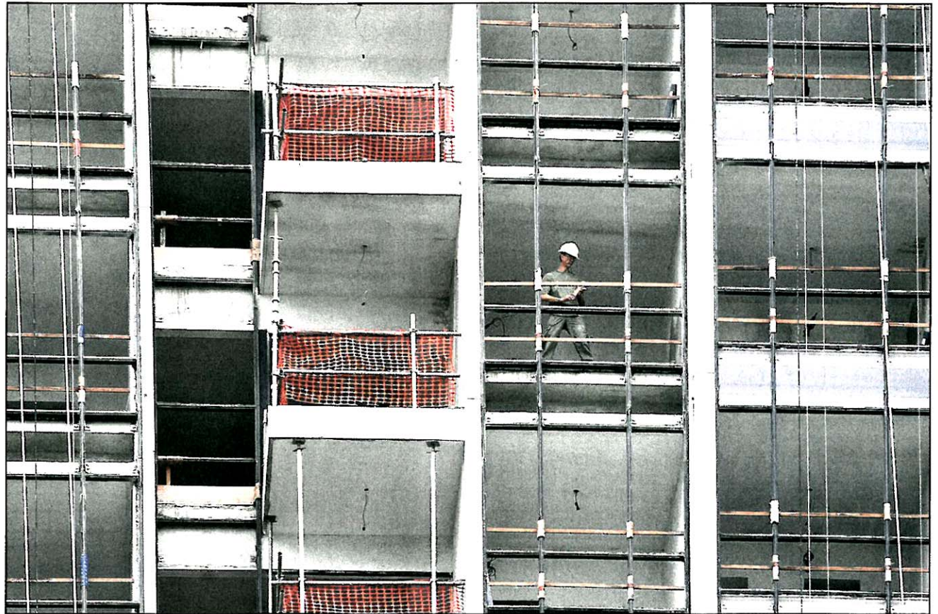
A condominium under construction on Minbu Road. There is concern that with real estate prices rebounding and new launches selling out, the Singapore property market could overheat again.

However, more worrying is affordability on an abso-